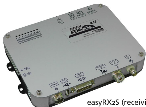
easyRX2S (receiving unit)

As a receiver, you need to have the Weatherdock AIS receiver easyRX2S which is tunable to the special customized VHF frequencies used for the marking and locating.